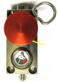
Integrated Manual Actuator